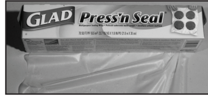
Press'n Seal for Bra Molds

* Solid copper wire, used by electricians, is best because it is easy to bend yet retains the shape desired. Stranded copper wire does not work.